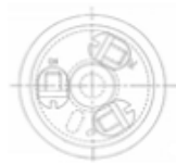
(3 terminal configuration)

Dual Circuit: NO—Normally open NC—Normally closed C--Ground