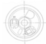
(2 terminal configuration)